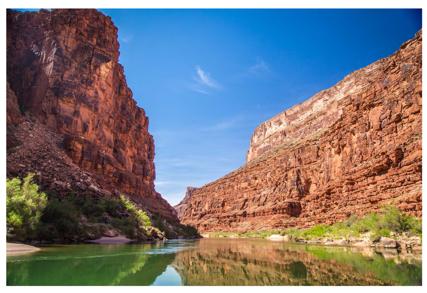
FIGURE 1. Grand Canyon.

Ancestral (archaeological) sites located in the Grand Canyon are interconnected to one another by trails, and these trails connect the sites to the Zuni Pueblo. As such, the sites and trails act collectively as spiritual connections between Zuni ancestors and present-day Zunis, connecting the places that define and maintain the spiritual connection to the Zuni cultural landscape. The Pueblo of Zuni considers all ancestral archaeological sites to have the status of traditional cultural properties (TCPs) because these places are tangible monuments validating Zuni emergence and migrations that play fundamental roles in sustaining Zuni individual and collective cultural identities. Speaking about the importance of these sites in teaching Zuni children about their history, a Zuni cultural advisor, Daniel Bowannie, exclaimed, "Being born at Zuni Pueblo doesn't make you Zuni; it's all these old places. The same blood still runs through our veins. This is where our culture came from" (Dongoske et al. 2019:131).