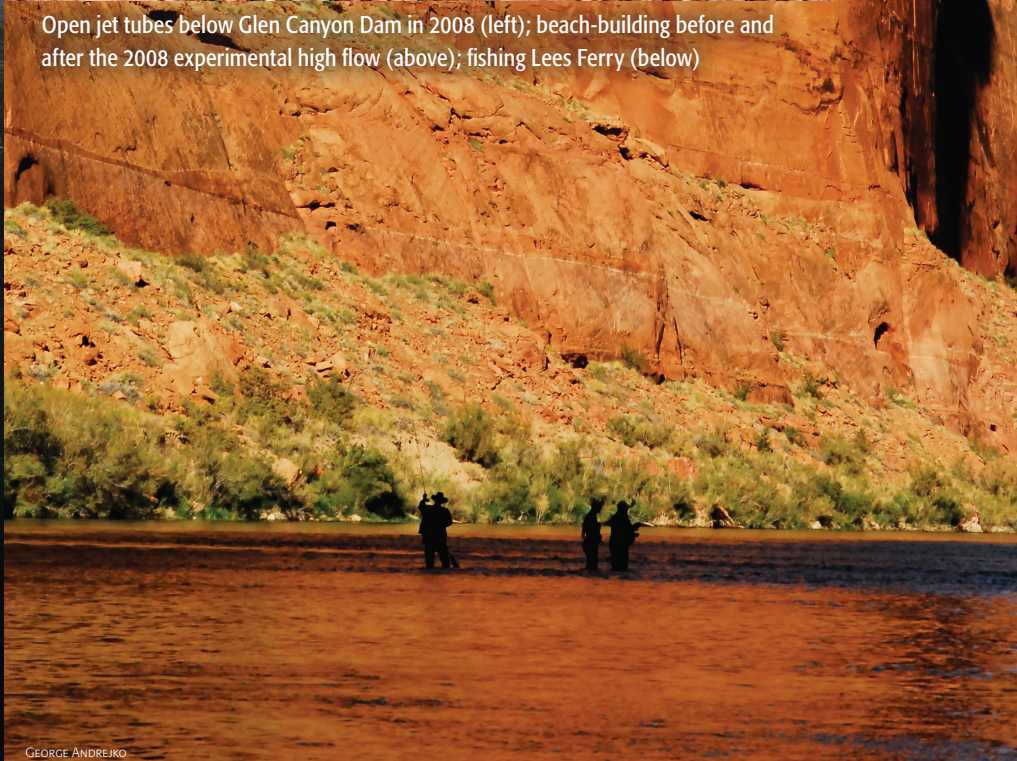
Open jet tubes below Glen Canyon Dam in 2008 (left); beach-building before and after the 2008 experimental high flow (above); fishing Lees Ferry (below)