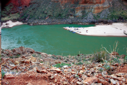
U.S. GEOLOGICAL SURVEY