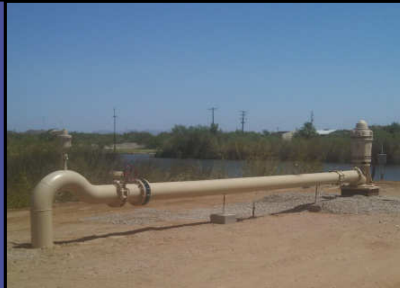
New Groundwater Well