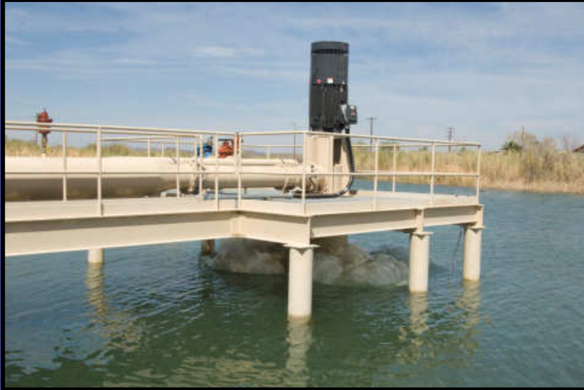
Martinez Lake Inlet Pump