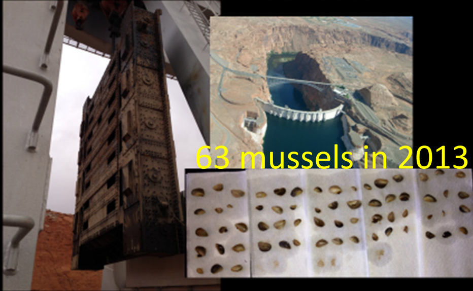
63 mussels in 2013