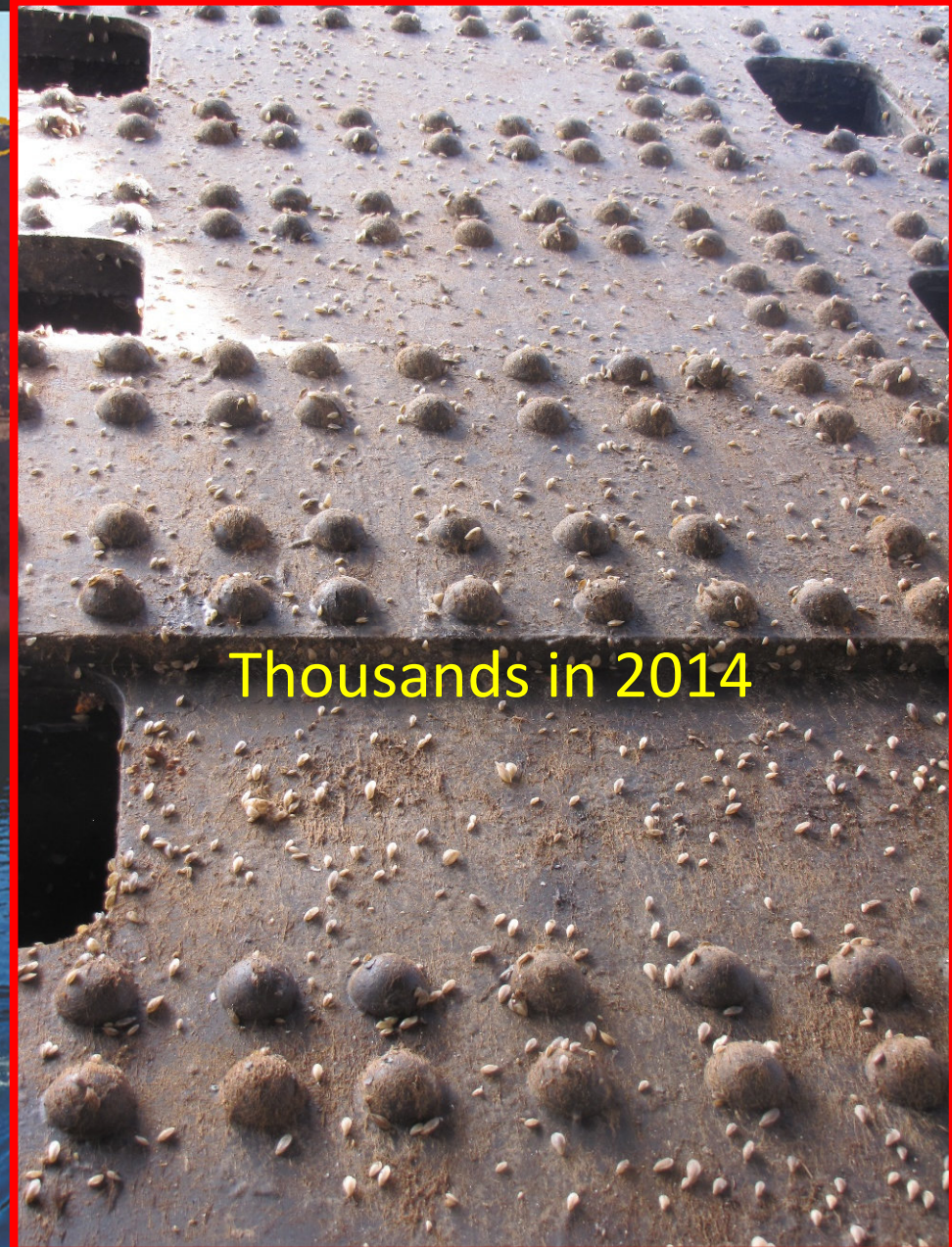
Thousands in 2014