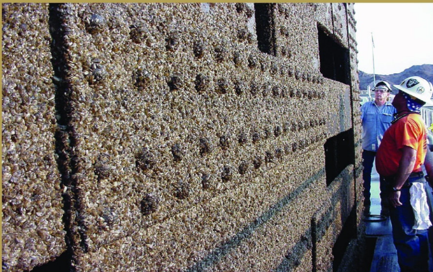
Davis Dam Penstock Gate Oct.07