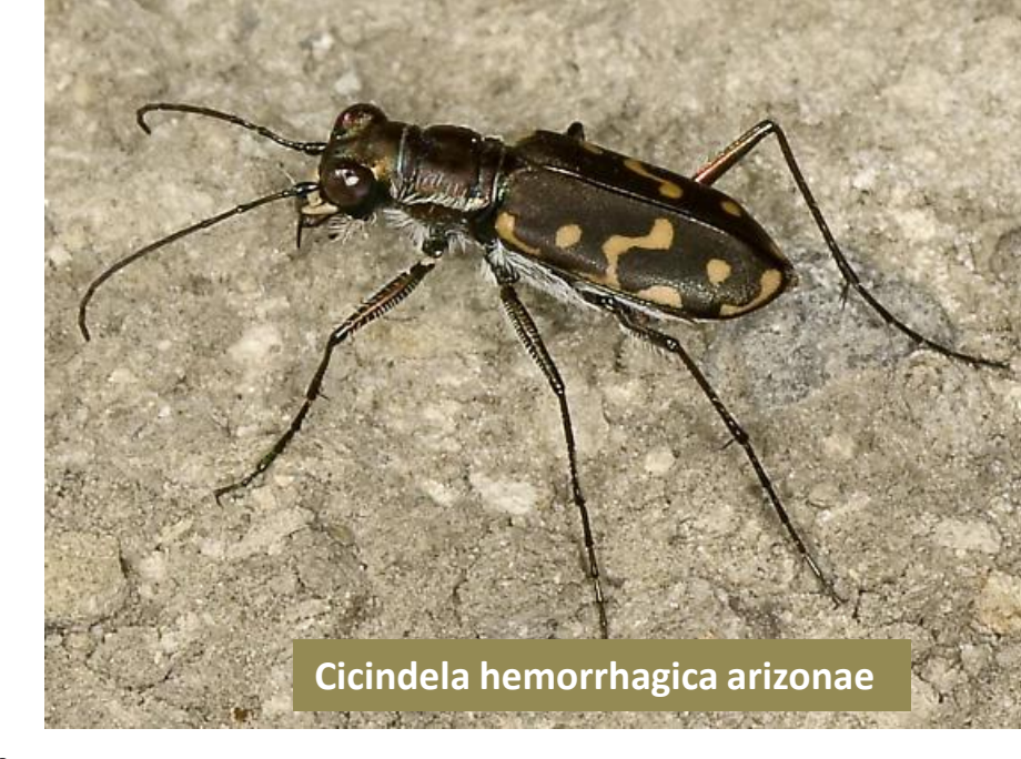
A Few CRE Endemic Insects